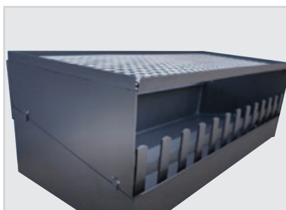
Alfresco logpan for wood fired grilling