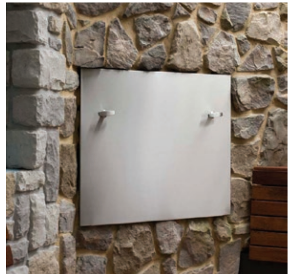
Optional stainless steel weather door